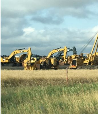
Aug 29/18 kick off looking to the north east as the picture as the was taking of 20 machines in the kick off area.