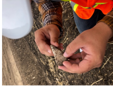
Aug 31/18 Bone found at SSKP 1025